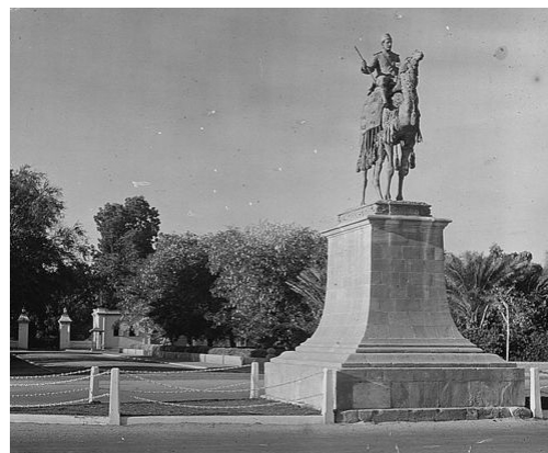
General Gordon's statue at Khartoum, pictured in 1936

course. Where they will eventually be placed is being considered."