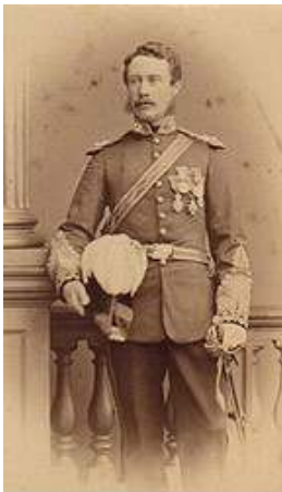
General Gordon In the 1870's

How intriguing. But where to begin to learn more of its history, should I begin with General Gordon himself, the reason for the statue, about the sculptor, or the statue's journeys and river dunkings? Well, that's the order I've followed.