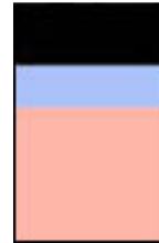
SS Cedardene 's funnel colours of Ellerman Lines

River Nile on its way to Khartoum. An eventful journey you could say. The Cedardene was wrecked in February 1903 off the coast of Morocco.