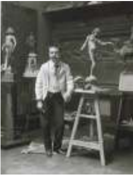
Edward Onslow Ford