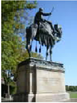
Statue of General Gordon at Gordon's School