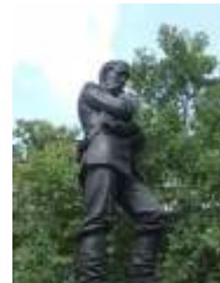
General Gordon by Hamo Thorneycroft

It's understandable that Onslow Ford would want to depict Gordon riding a camel, as it was well known that General Gordon was a great camel rider. In one of his letters he states it was only by hard camel riding that he held his position and respect among the people in Sudan.